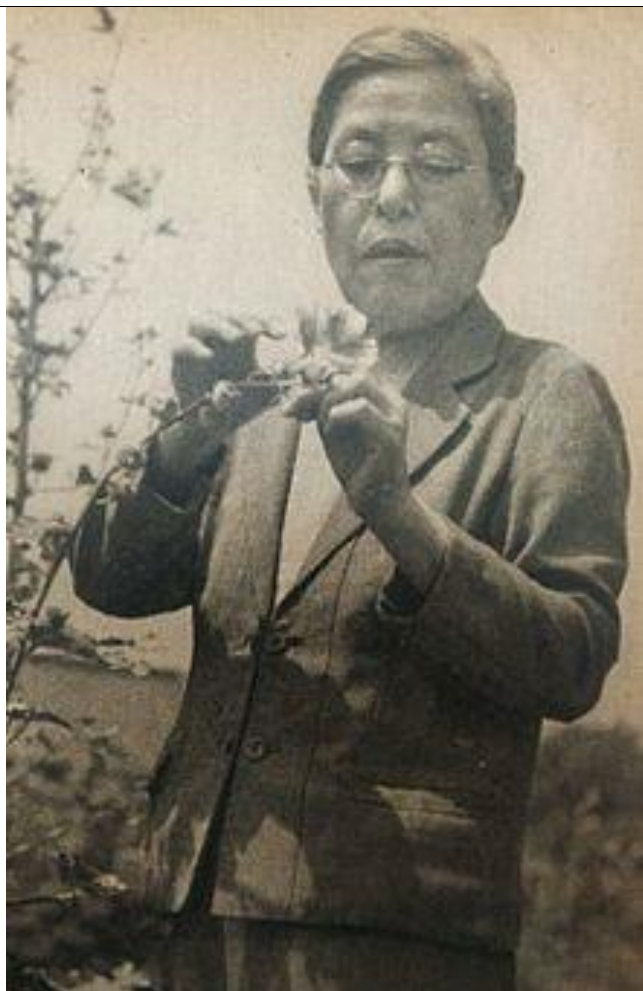
Figure 8. Kono Yasui.

Despite these hard and unusual conditions that the Ministry had imposed on her to study abroad, Yasui accepted them and went to study first at the University of Chicago and later at Radcliffe College, at Harvard University. There she began researching charcoal, discovering six ancient plant species and unraveling the processes by which living plants transform into charcoal. Upon her return to Japan, she went on to teach again at the Tokyo Women's High School (Figure 09).