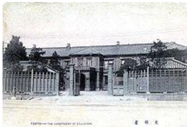
Figure 01. Headquarters of the Ministry of Education in Tokyo in 1902.