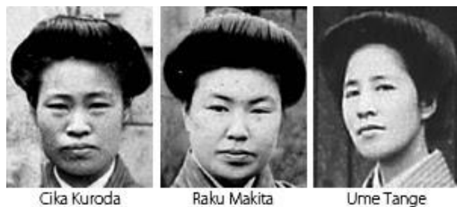
Figure 12. Three of the first university women of Japan.

Between 1913 and 1923 women were allowed to become non-regular students or guest auditors at the universities of Toyo, in 1916, Hokkaido Imperial, in 1919, and Kyoto Imperial, Waseda and Keio, in 1921 (Kodate and Kodate, 1916).