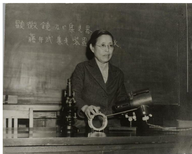
Figure 10. Kono Yasui teaching in the Ochanomizu University.

Soon after, the Imperial University of Tokyo recognized its mistake and awarded her a Ph.D. in 1927, despite the fact that she was not officially a student. This made her the first Japanese woman to earn a Ph.D. in science. In addition, that University to honor her, as the same as Chika Kuroda, the second Japanese woman to obtain a scientific doctorate, established the Yasui-Kuroda Scholarship to support women studying natural sciences. In addition, she transformed the Tokyo Women's High School into a women's research university (renamed Ochanomizu University), where she became a research professor (Figure 10).