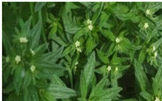
Figure 05. El Lithospermum erythrorhizon .

(Figure 5). The dried root of Lithospermum erythrorhizon ( lithospermum root or Lithospermi Radix ) is a Chinese herbal medicine with various antiviral and biological activities, including inhibition of human immunodeficiency virus type 1 (HIV-1).